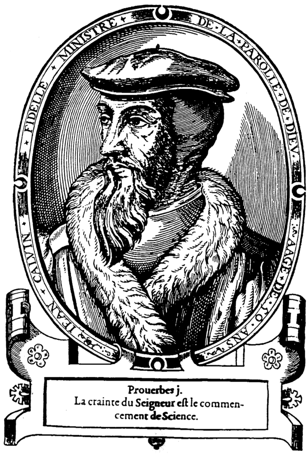
Figure 1. John Calvin at fifty. From Veldman (1990, p. 49).